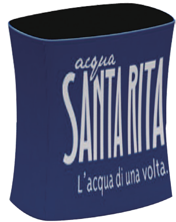
Assembled frame with graphic